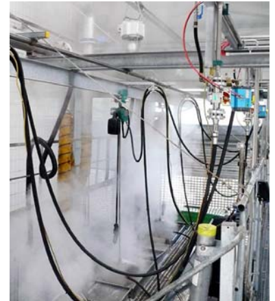
Handling of high pressure injection heads in a tank cleaning installation with a JDN Air Hoist PROFI 05 TI in manual trolley.

The variety of applications for JDN Air Hoists can be derived from the numerous industries and branches where JDN Air Hoists are deployed. The quality standard of JDN Air Hoists which is much higher than the applicable norms is achieved amongst others by qualifying in extreme applications, whereby safety and security are of utmost priority. With its technical innovation J.D. NEUHAUS offers solutions to almost every material handling problem irrespective of the driving medium: from air, manual and hydraulic hoists up to complete crane installations with explosion proofness. The following are examples of the wide range of applications of JDN products in standard situations of material handling up to special tailor-made solutions to very specific problems.