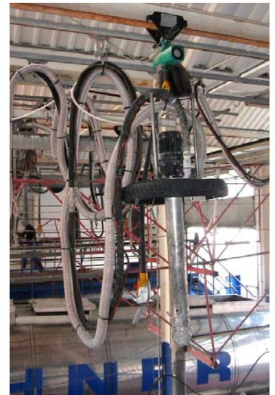
JDN Air Hoists mini in manual trolley working in a tank cleaning installation.